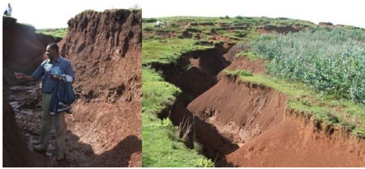
Plate 4: Gulleying in the catchment of the Meja River.